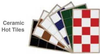
Ceramic Hot Tiles

* replace “-” with colour code when ordering