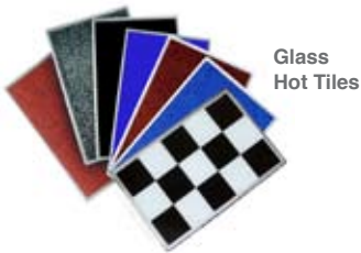
Glass Hot Tiles